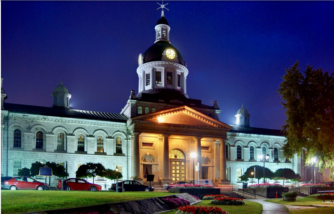
Kingston City Hall

But the choice of Kingston City Hall for the proclamation of the first pan-Ontario legislation giving municipalities the power to designate and protect heritage property was not so much about the building itself, but about the city it represented. The Lieutenant Governor's presence and action in Kingston that day was above all a tribute to the city's pioneering role in pushing for legislation to protect historic buildings. In the late 1960s and early 1970s the efforts of Kingston — propelled by its citizen groups — to protect its "old stones" resulted in the first-ever Ontario statute to enable a municipality to designate property of architectural or historical value or interest.