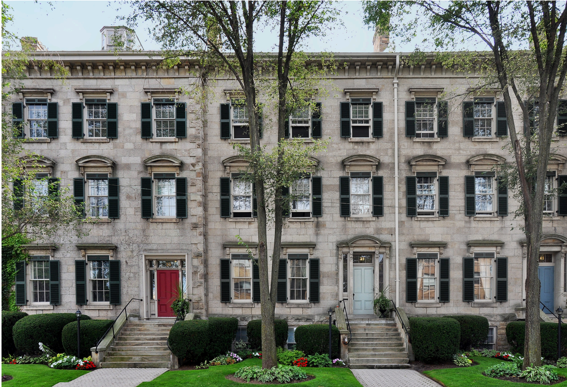
Sandyford Place, Hamilton

Fifty years on the Ontario Heritage Act has seen a lot of changes — some for the better, others... not so much. Amendments in the last several years have compromised key measures of the statute and weakened its protections. But the real achievement of the Act endures: the empowerment of local communities and their impassioned citizens to preserve and protect the historic places they hold dear.