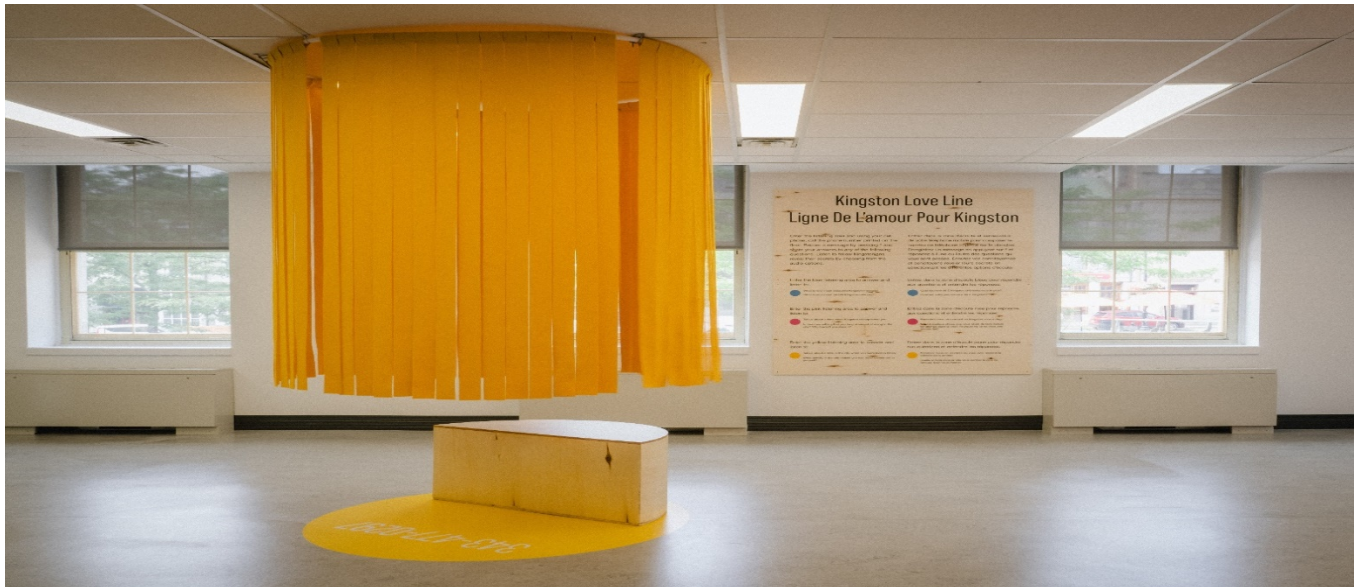
Figure 5 Station 5 at 36 Questions

At Station 5, participants were offered a seating area and prompted to call up to three different phone numbers to respond to six unique questions using a digital voice mail system. Participants were offered the opportunity to interact with English or French voice mail systems.