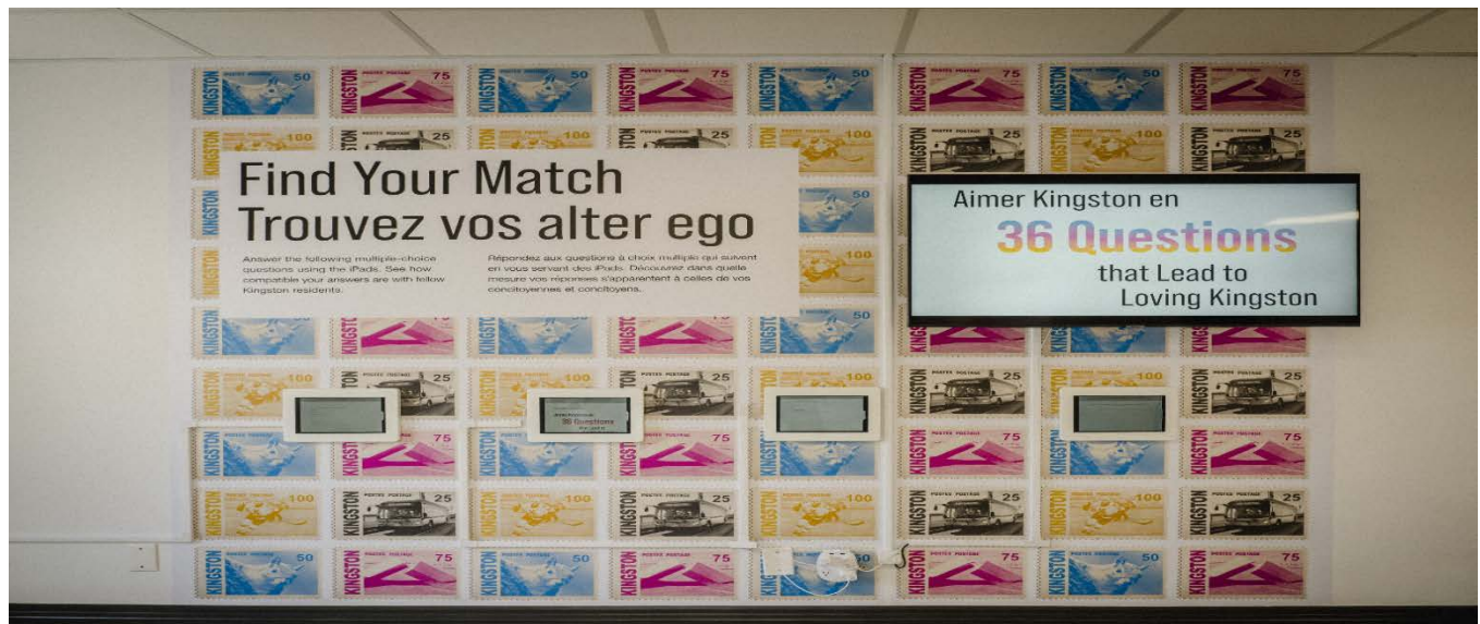
Figure 1 Station 1 at 36 Questions

At Station 1, participants were prompted to answer a series of multiple-choice questions to see how compatible their responses were with other exhibit visitors.