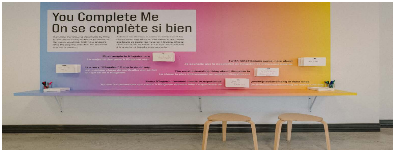
Figure 2 Station 2 at 36 Questions

At Station 2, participants were prompted to complete statements by filling in the blanks on the paper provided. Participants could complete statements using words or pictures. All responses were recorded.