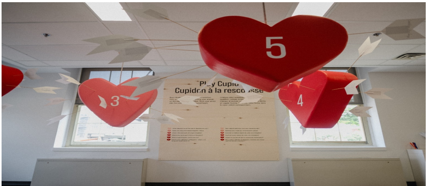
Figure 3 Station 3 at 36 Questions

At Station 3, participants were prompted to answer questions about their connection to Kingston, specifically things they liked or disliked about Kingston and what they believed Kingston should be famous for. This interactive station directed participants to insert answers into large foam hearts.