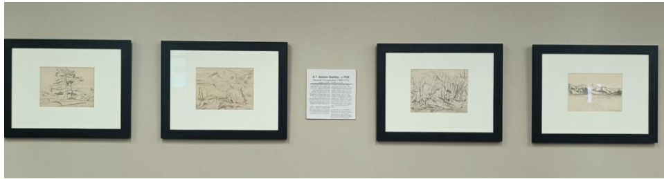
A.Y. Jackson Sketches

This is the first step in an ongoing process to introduce a variety of works of art to Kingston City Hall National Historic Site. The works are on display in a semi-permanent capacity.